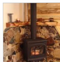
Custom Wood Mantles