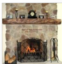
Rustic Naturewoods Mantels for Sale