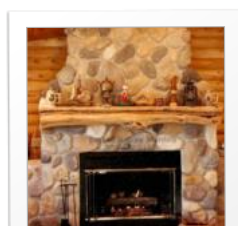
Log Fireplace Mantels For Sale

If you are interested in visiting our home office, please contact us for available appointment times and directions.