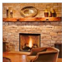
Rustic Timber Woods Mantels For Sale