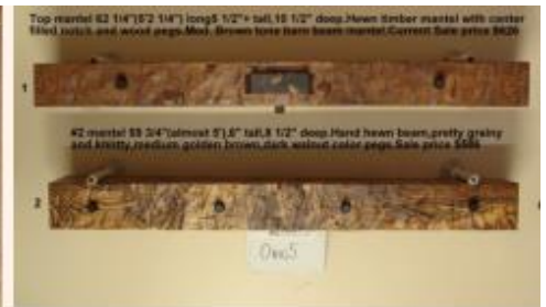
Timberwoods Mantel Photo ORIG5 (5' - 6' lengths)