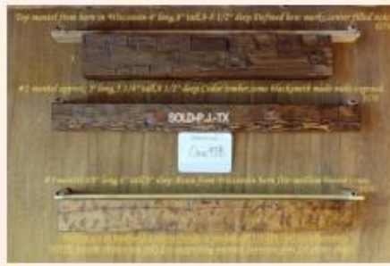
Timberwoods Mantel Photo ORIG45B (4' - 5' lengths)