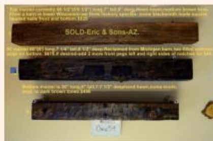
Timberwoods Mantel Photo ORIG54 (4' - 5' lengths)