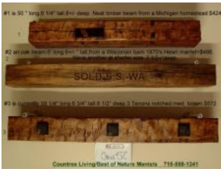
Timberwoods Mantel Photo ORIG45C (50'' - 60'' lengths)