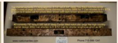
Timberwoods Mantel Photo ORIG67-2 (7' and can shorten)