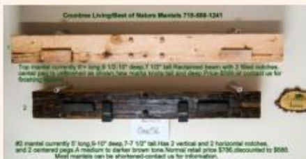
Timberwoods Mantel Photo ORIG56 (5' - 6' lengths)

If you see a mantel you like in the photos above, contact us at (715) 588-1241 with the photograph #/Info of which mantel for an exact price based on your specified length.