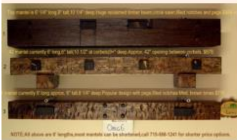
Timberwoods Hand Hewn Mantels (5' - 6' lengths)