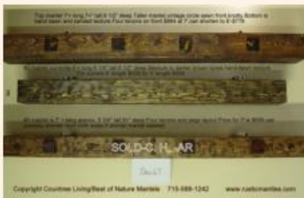
Timberwoods Mantel Photo ORIG67 (6' - 7' lengths)