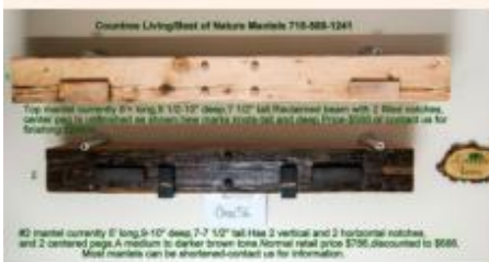
Timberwoods Mantel Photo ORIG56 (5' - 6' lengths)

If you see a mantel you like in the photos above, contact us at (715) 588-1241 with the photograph #/Info of which mantel for an exact price based on your specified length.