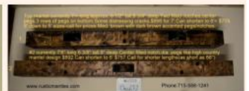
Timberwoods Mantel Photo ORIG67-2 (7' and can shorten)