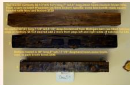
Timberwoods Mantel Photo ORIG54 (4' - 5' lengths)