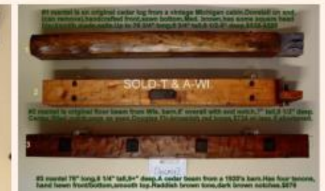
Timberwoods Mantel Photo ORIGMIX2 (5' - 6' lengths)