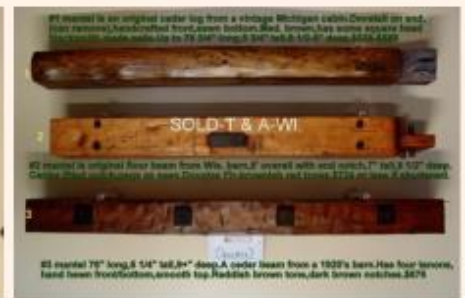
Timberwoods Mantel Photo ORIGMIX2 (5' - 6' lengths)