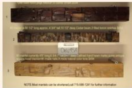
Reclaimed Wood Mantels (4' - 5' lengths)