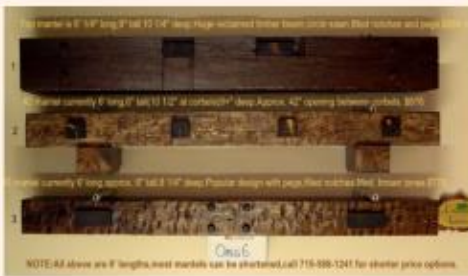
Timberwoods Hand Hewn Mantels (5' - 6' lengths)