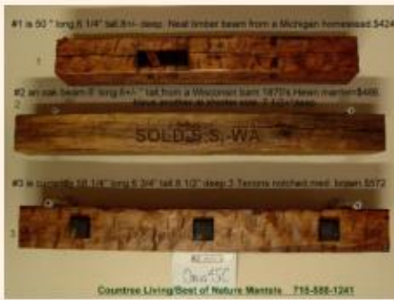
Timberwoods Mantel Photo ORIG45C (50'' - 60'' lengths)