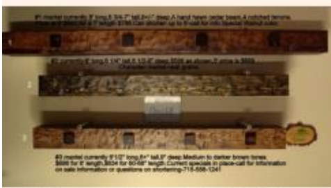
Timberwoods Mantel Photo ORIG68 (6' - 8' lengths)