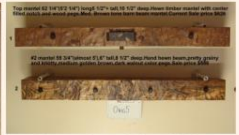
Timberwoods Mantel Photo ORIG5 (5' - 6' lengths)