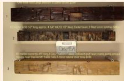
Reclaimed Wood Mantels (4' - 5' lengths)