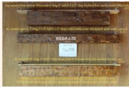
Timberwoods Mantel Photo ORIG45B (4' - 5' lengths)